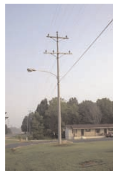
Steel pole advantages include less costlydisposal, their ability to be reset, the increased safety for motorists and aesthetics.

"We have had some incredible examples of accidents where steel poles provided a strong advantage," Phillips notes. "In one case, a Tennessee Department of Transportation employee who ironically was doing a study on our compliance of clear zones hit a steel pole, deflecting the pole approximately 4 feet — just above the ground line. The pole remained upright, the framing remained intact, all conductors remained in the air and the lights stayed on except for one breaker operation. Most importantly, the driver walked away from the accident with only minor bruises. Since this was a two-piece pole, we were able to salvage the top of the pole as a 40-foot steel pole. My opinion is that a wood pole would have failed catastrophically in this situation."